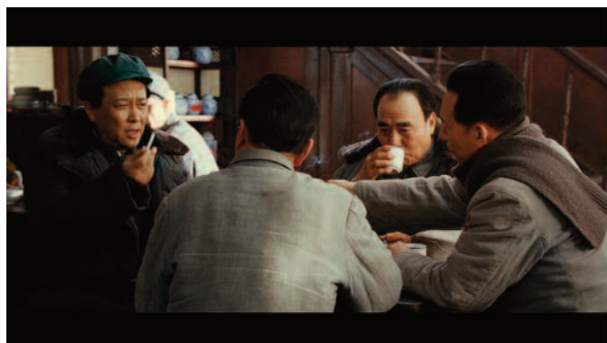
Mao gestures with a hard-to-find cigarette as he begins discussing the place of private business in the Revolution with Ren Bishi (back), Zhu De and Liu Shaoqi in Founding of a Republic . © China Film Group/Emperor Classic Films, 2009.

© China Film Group/Emperor Classic Films, 2009.