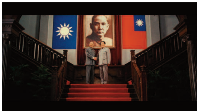
Chiang Kai-shek (Zhang Guoli) and Mao Zedong (Tang Guoqiang) meet in Chongqing at the beginning of Founding of a Republic .