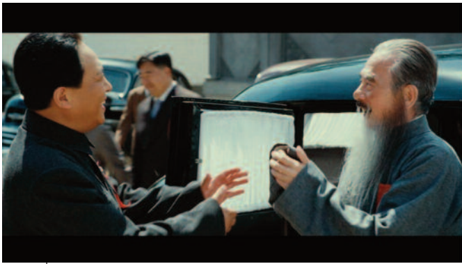
Mao greets Zhang Lan (Wang Bing) before the opening of the first CCPPC in Founding of a Republic .