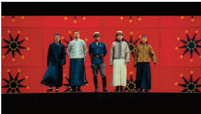
Zhang Mazi (Jiang Wen, in the middle) surrounded by Ma Bangde (Ge You, on his left) and Huang Silang (Chow Yun-fat, on his right) haranguing the inhabitants of Goose Town against the background of the first Republican Flag in Let the Bullets Fly.

wards the revolutionary left or the liberal right. In either case, its box office success alone makes it an interesting object of study for probing how far the “mainstream socialist culture” advocated by the Mao films can influence the real mainstream. The “indie” flavour brought into the film by Jiang Wen’s beginnings makes the mix only more potent.