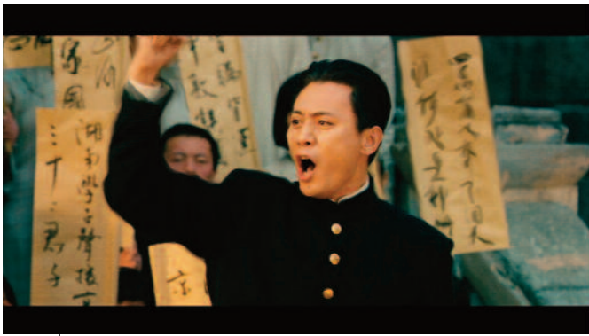
Mao Zedong (Liu Ye) harangues students during May Fourth demonstrations in Changsha in Beginning of the Great Revival .