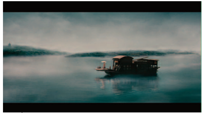
The First Congress of the PCC finally takes place on a boat on West Lake in Beginning of the Great Revival . At the front of the boat, Li Da's wife Wang Huiwu (Zhou Xun).

© China Film Group/Emperor Classic Films, 2009.